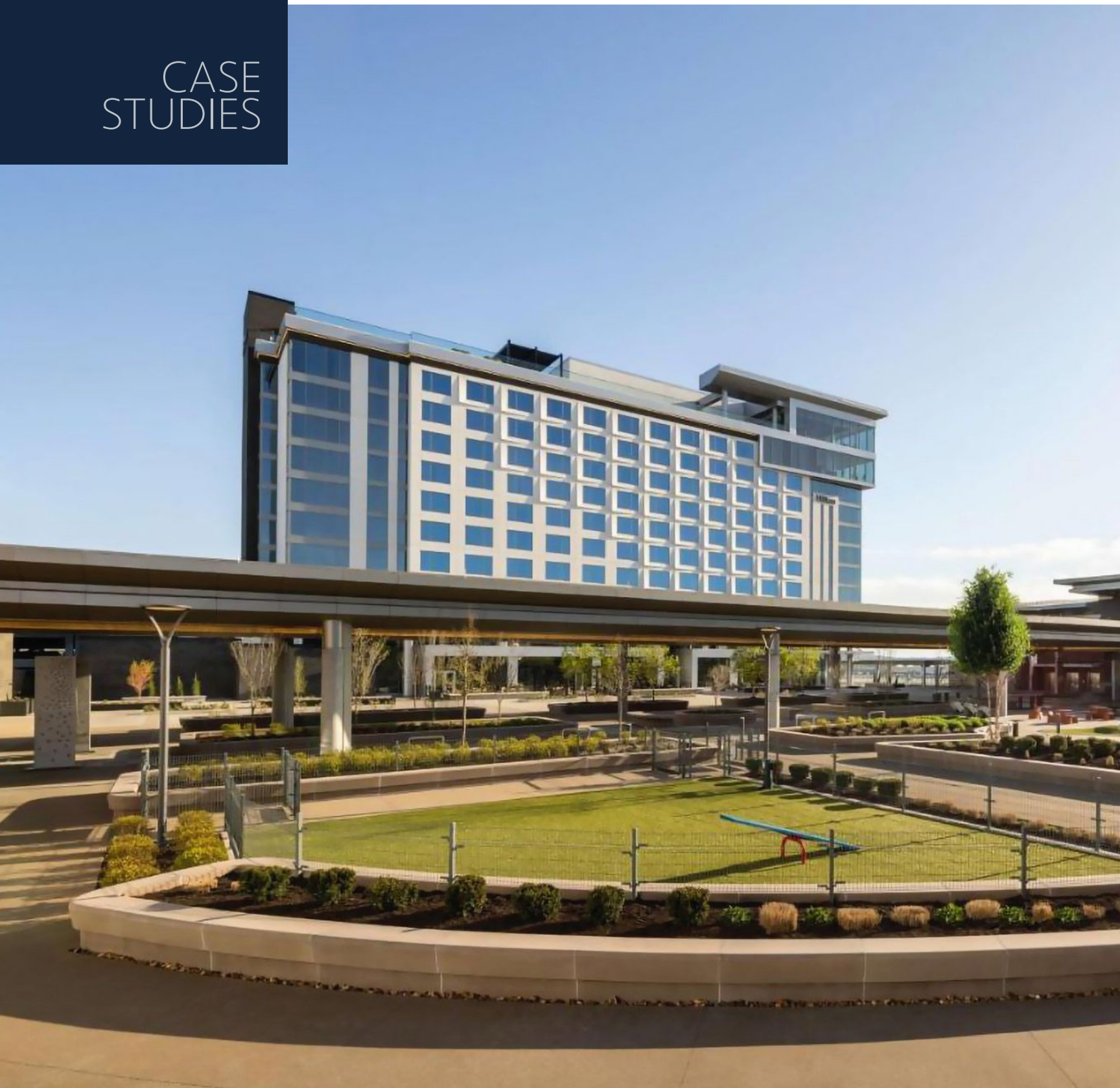
The Hilton BNA Nashville Airport Terminal Hotel is constrained between two existing parking structures on either side and a heavily traveled airport loop at the front and back of the property.