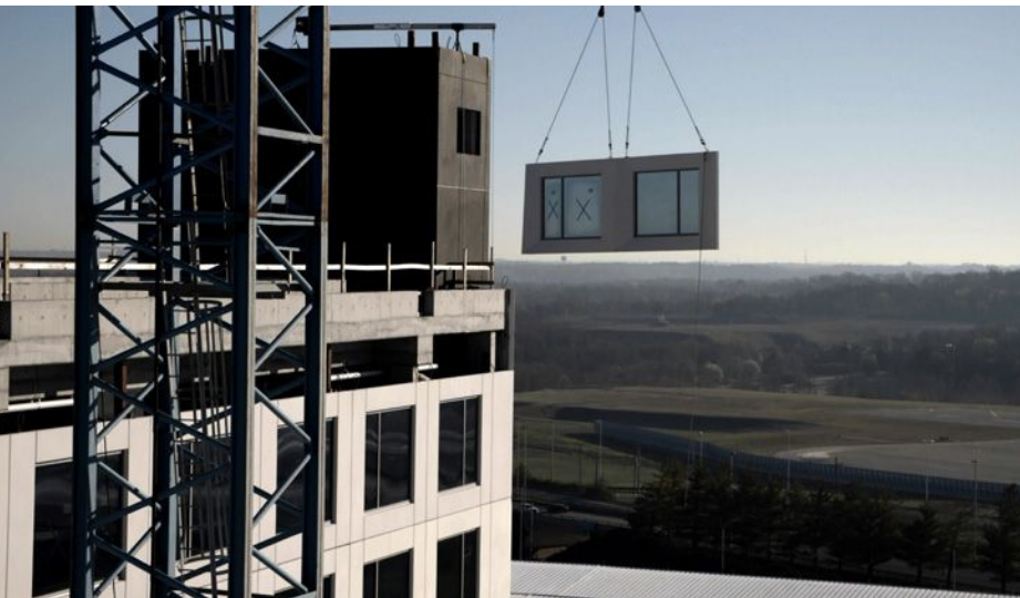
Installation involved only one tower crane to lift the precast concrete panels into place. Each had sizable window openings measuring roughly 6 ft 8 in. tall by 9 ft long.